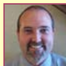
David Cato Lee Memorial Health System