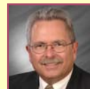
John Reed Larson Allen LLP