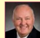
Robert Simpson LeeSar Regional Service Center